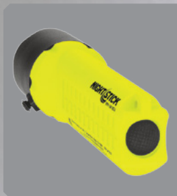
Single tail switch

cETLus, ATEX, and IECEx listed Intrinsically Safe