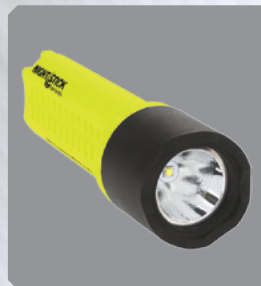
High-efficiency deep parabolic reflector