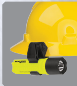
Clip Mount (mounts to either side of helmet)