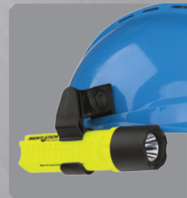
Slot Mount (mounts to either side of helmet)